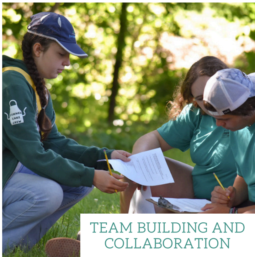
TEAM BUILDING AND COLLABORATION