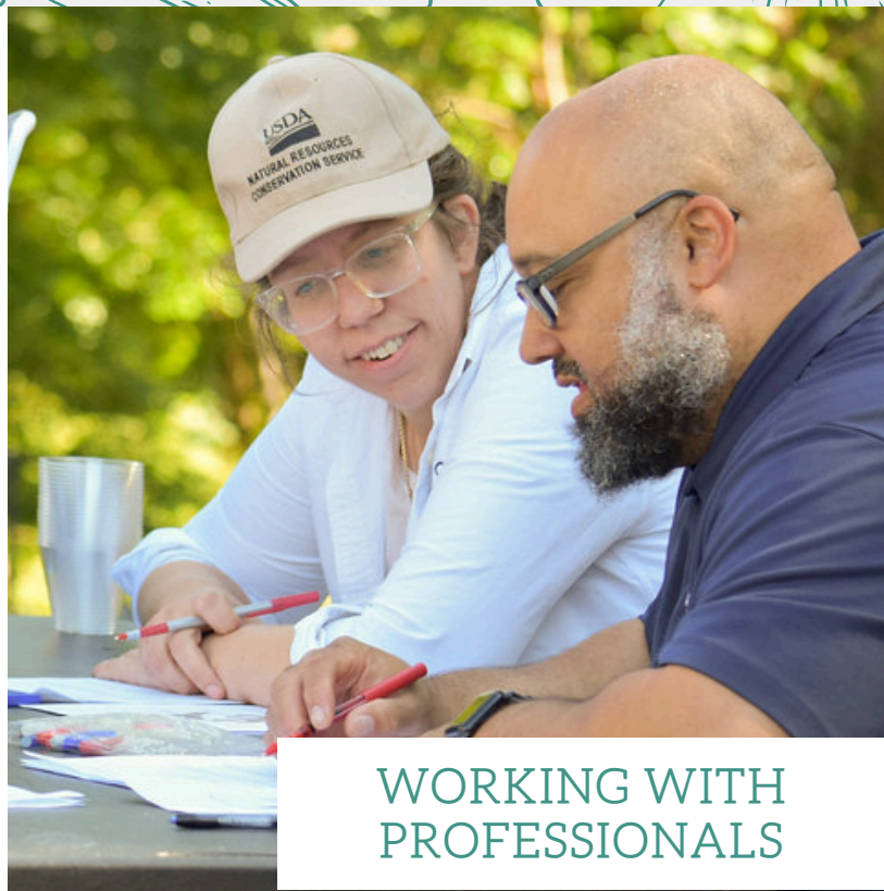
WORKING WITH PROFESSIONALS