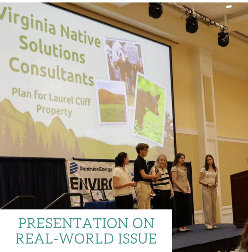
PRESENTATION ON REAL-WORLD ISSUE