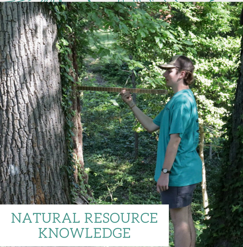
NATURAL RESOURCE KNOWLEDGE